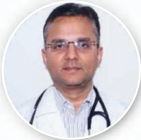
Dr. Harsh Vardhan